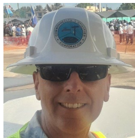
Cretian Vorg Town of Colonie